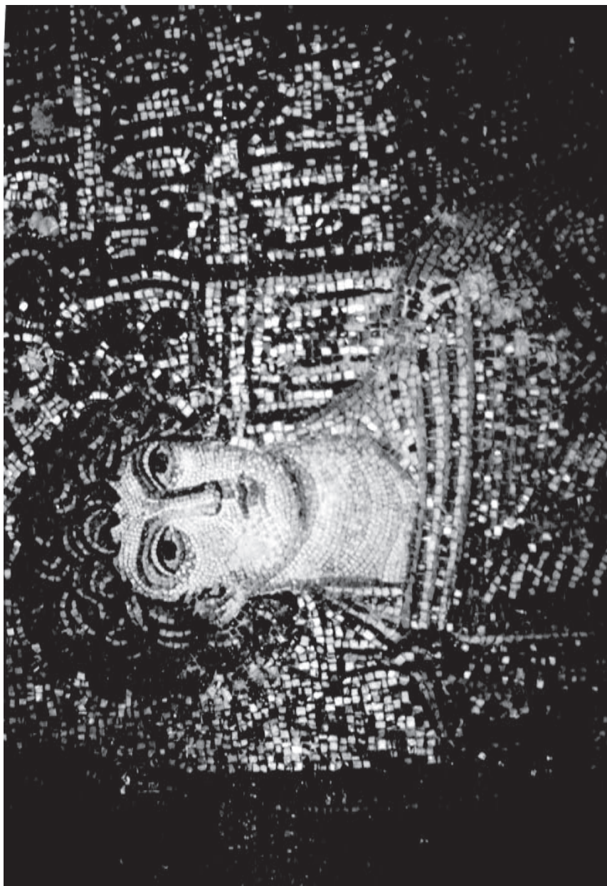
Plate 2. Face of Onesiphoros.