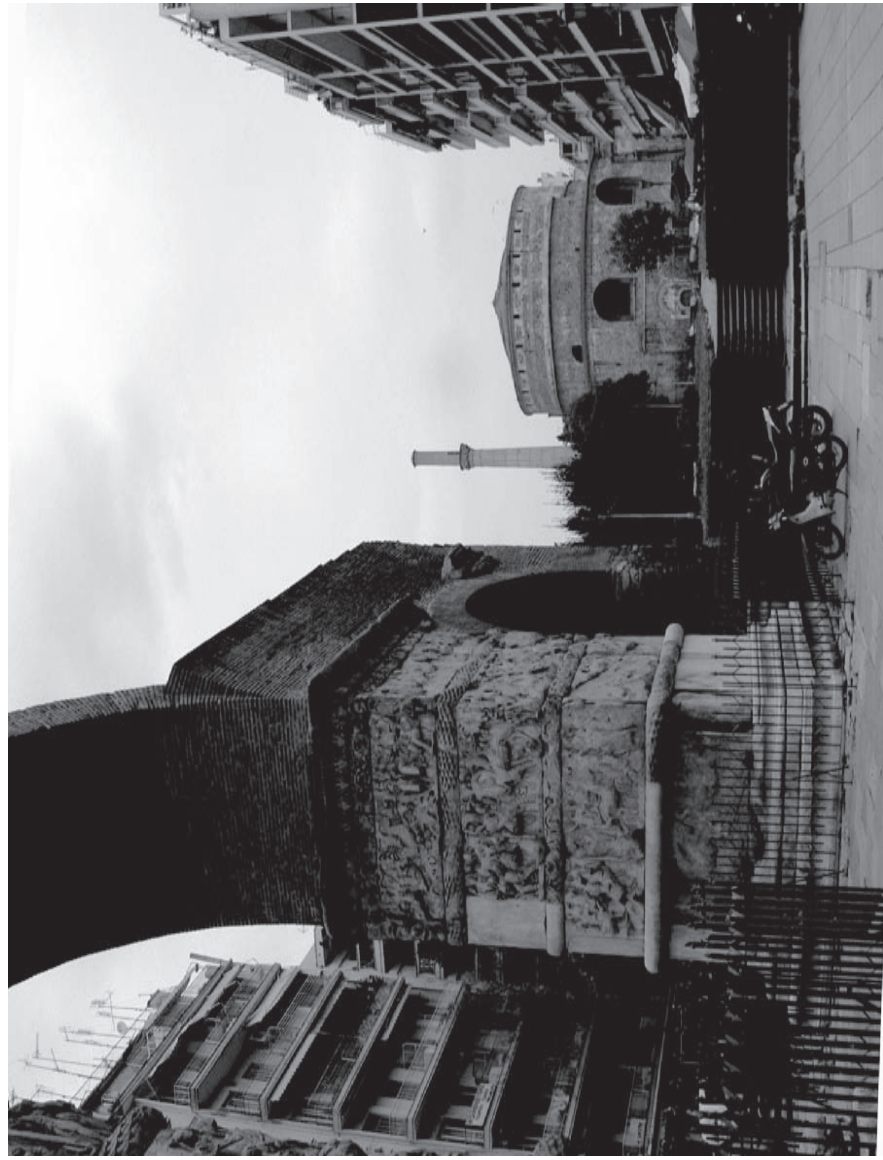
Plate 1. View of the Rotunda and the remains of the Arch of Galerius from the south. The original arch would have been paired with pillars to the east, as well.