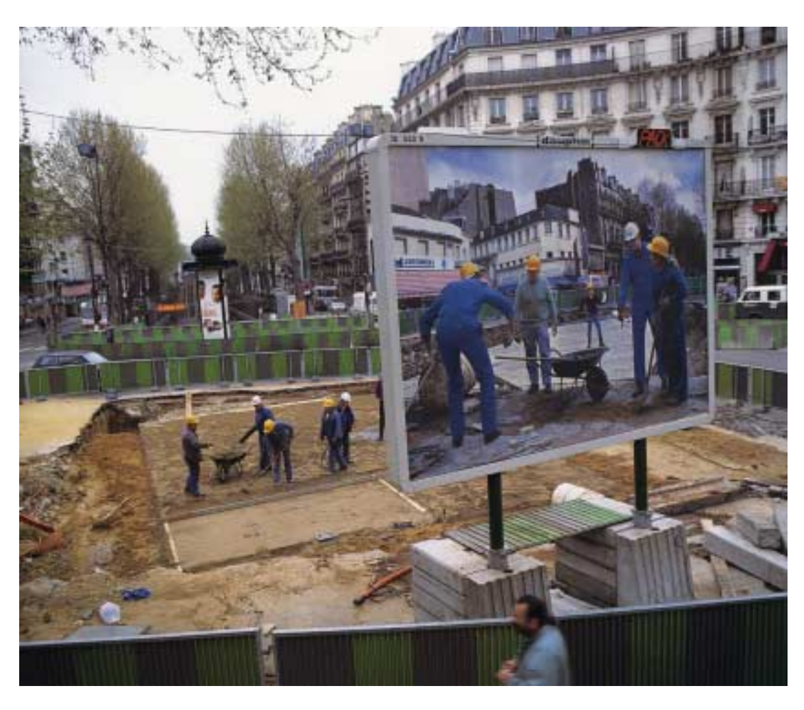
Pierre Huyghe, Chantier Barbès-Rochechouart, 1994/1996, Billboard and offset printed poster 80 × 120 cm.

people are presented by the performance of people. The taboo on the social content of art has continued to haunt Wall. Pierre Huyghe's Billboards dramatise the picturing of social relations in Wall's art-photography of everyday life. Actors perform a scene in response to the location of a billboard, which is then photographed and pasted onto the billboard. A confrontation is generated between the space of the picture and the space of its situation, outside of the museum that Wall has been so keen to occupy. This confrontation is then re-photographed and exhibited, reincorporating this drama into a picture. These works present a point of indifference between relational art and art-photography.