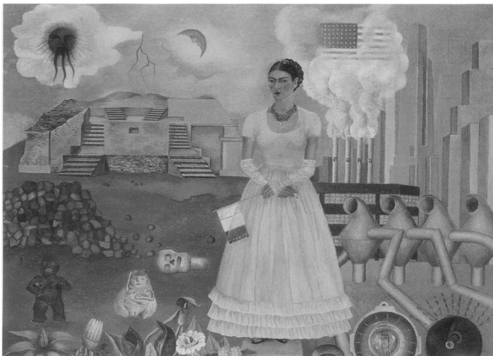
Fig. 2. Frida Kahlo, Self-Portrait on the Border Between Mexico and the United States (1932), oil on metal, 31 x 35 cm. Manuel Reyero, New York.

the Isthmus of Tehuantepec is one of the few recurring indigenous images in Kahlo's work that is not Aztec. Because Zapotec women represent an ideal of freedom and economic independence, the image of their dress probably appealed to Kahlo. 14 However, the reference to freedom and liberty is combined with Aztec imagery in at least four of Kahlo's works, thereby uniting the two sources into one statement of cultural nationalism dominated by the Aztec. This use of the Tehuana dress with Aztec symbols occurs in Memory (1937; see front cover), Remembrance of an Open Wound (1938), The Two Fridas (1939), and The Love Embrace of the Universe, the Earth (Mexico), Diego, Me and Señor Xolotl (1949).