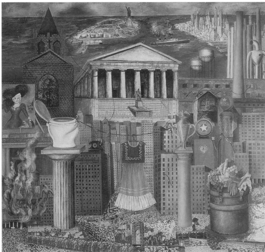
Fig. 3. Frida Kahlo, My Dress Hangs Here (1933), oil and collage on masonite, 46 x 50 cm. Dr. Leo Eloesser Estate.

Coatlicue as symbol is significant in a number of Kahlo's self-portraits. In Self-Portrait Dedicated to Sigmund Freud (1940) and Self-Portrait With Braid (1941), the traditionally clad Kahlo wears Coatlicue's skull necklace. In Self-Portrait With Thorn Necklace and Hummingbird (1940; Fig. 4), Kahlo's thorn necklace draws blood from her neck. Aztec priests performed self-mutilation with agave thorns and stingray spines, and Coatlicue's neck also bleeds. The dead hummingbird is sacred to the chief god of Tenochtitlan, Huitzilopichtli, the god of the sun and of war. It also represents the soul or spirit of the warrior who died in battle or on the sacrificial stone. In Self-Portrait Dedicated to Dr. Eloesser (1940), Kahlo covers her head with flowers, and a necklace of thorns again draws blood from her neck. She also wears a small hand as an earring. Both the Coatlicue and the kneeling death goddess sculptures wear hands as trophies around their necks. The drawing Self-Portrait Dedicated to Marte R. Gomez (1946) shows her wearing a hand earring and, although her neck is not pierced, it is covered with an intricately webbed necklace that zigzags tightly around her neck. The top of the necklace looks precisely like the zigzag lines in Aztec sculpture that represent a severed head or limb. This type of line, representing the fatty layer of