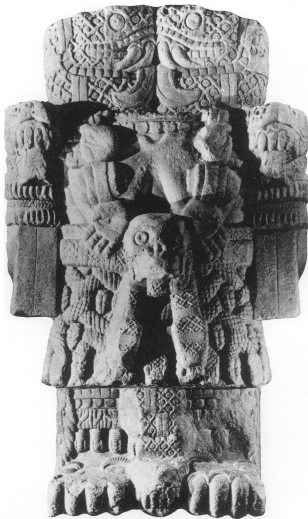
Fig. 1. Coatlicue, stone, late postclassic. Mexican National Museum of Anthropology, Mexico City.

Another painting from her American sojourn, My Dress Hangs Here (1933; Fig. 3), scourges the United States with pictures of a toilet, a telephone, a sports trophy, a dollar sign wrapped around the cross of a church, the steps of a federal building depicted as a financial graph, and Mae West as Hollywood fantasy. The incorporated photographs highlighting the plight of the Depression-era unemployed in the lower part of the canvas depict the contrast between wealth and poverty in American society. In the midst of moral decay, corruption, poverty, and suffering, Kahlo places a pristine image: the Tehuana dress. This traditional costume of Zapotec women from