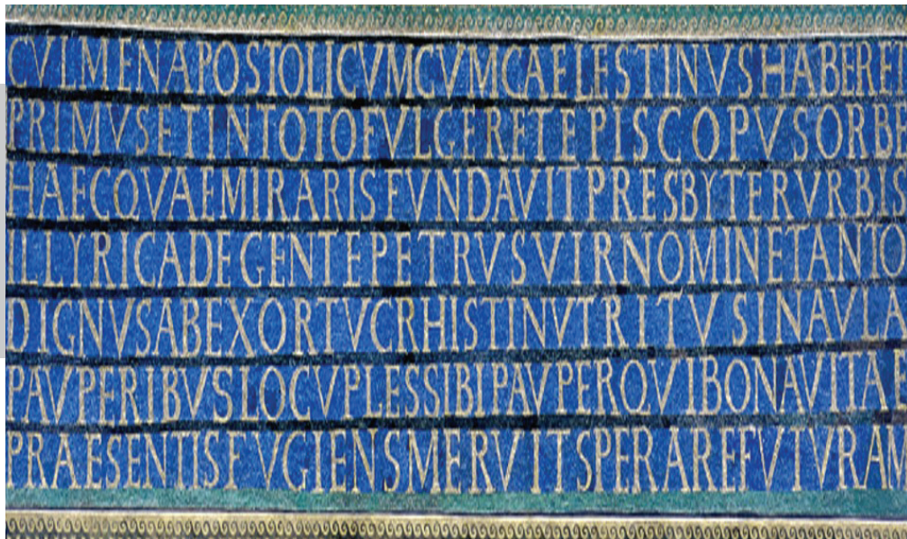
Figure 4: 5th Century, Santa Sabina, tesserae