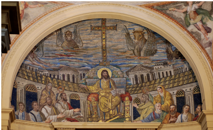
Figure 6: Apsidal Mosaic , 5th Century, Santa Pudenziana, tesserae