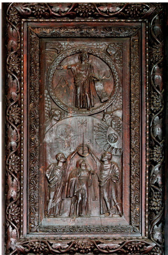
Figure 9: Parusia door panel , 5th century, Santa Sabina, wood