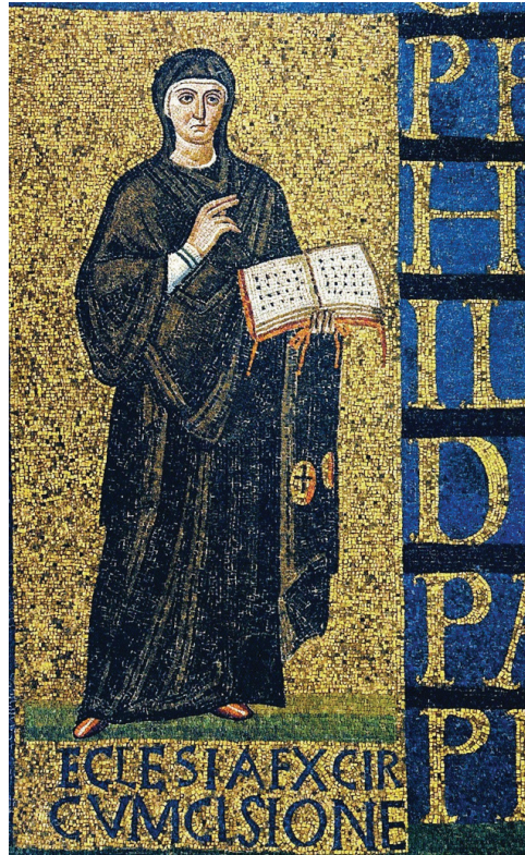
Figure 2: Ecclesia ex Gentibus , 5th Century, Santa Sabina, tesserae