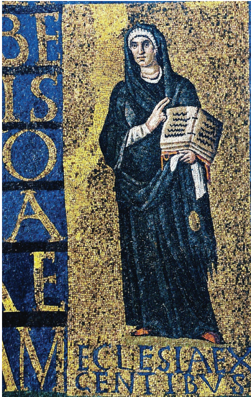
Figure 1: Ecclesia ex Circumcisione , 5th Century, Santa Sabina, tesserae