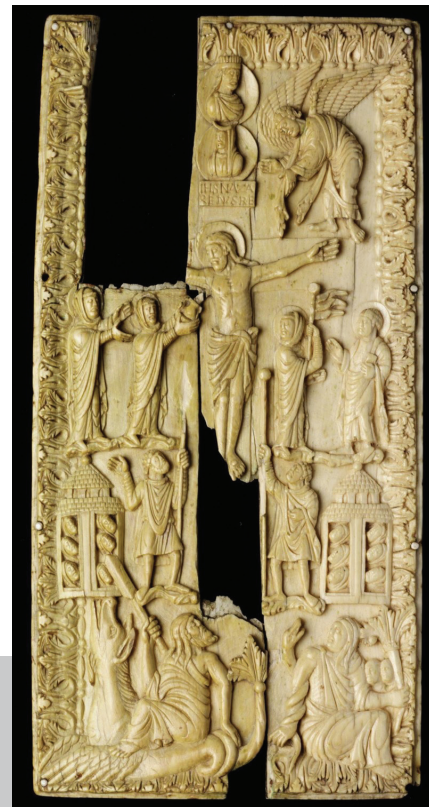
Figure 3: The Crucifixion c. 860 C.E., Ivory